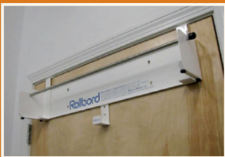
Rollbord Disposable Cover Dispenser Part # 440.1088