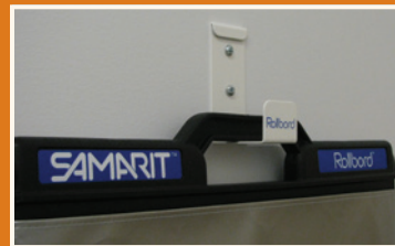
Rollbord Wall Mount Hanger Part # 440.1086