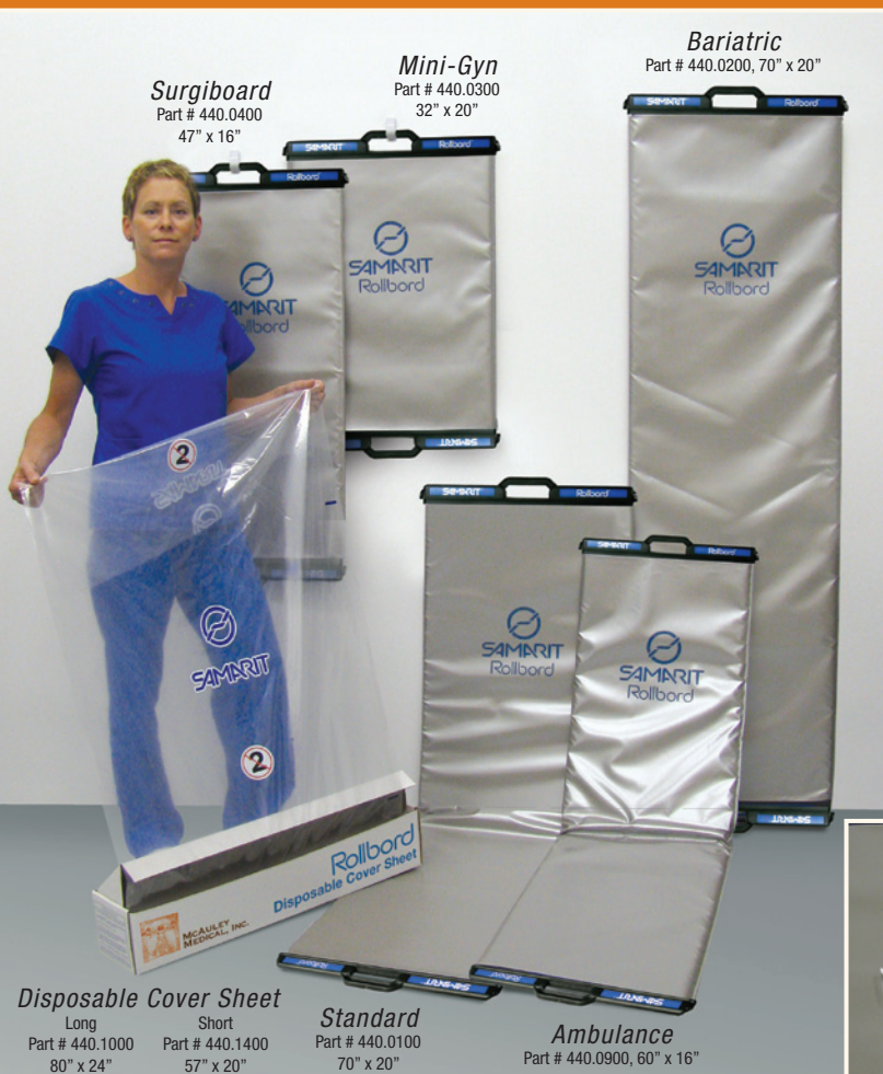
Surgiboard Part # 440.0400 47" x 16"

OUR UNIQUE PATENTED CONVEYOR BELT ACTION CARRIES PATIENT FROM SURFACE TO SURFACE, POWERED ONLY BY A GENTLE "PUSH"