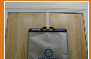
Rollbord Door Mount Hanger Part # 440.1087