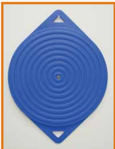
Part # 470.0380 15" Diameter