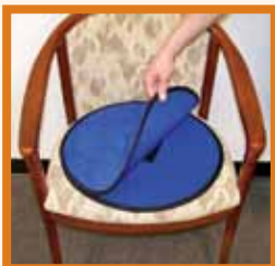
Large Part # 8.01 18" Diameter (shown)